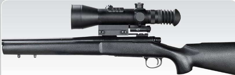
NIGHT ARROW 4 on the rifle