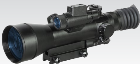
NIGHT ARROW 4 on the rifle