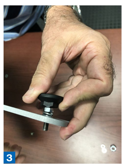
Install the stabilizing pegs on the four corners of the base plate making sure it is leveled.