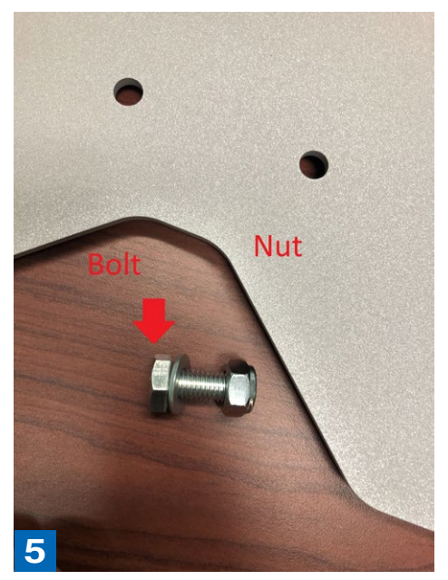
Repeat the process with the interior nuts and bolts. Align the floor stand over the interior bolts. Secure the base plate to the floor stand.