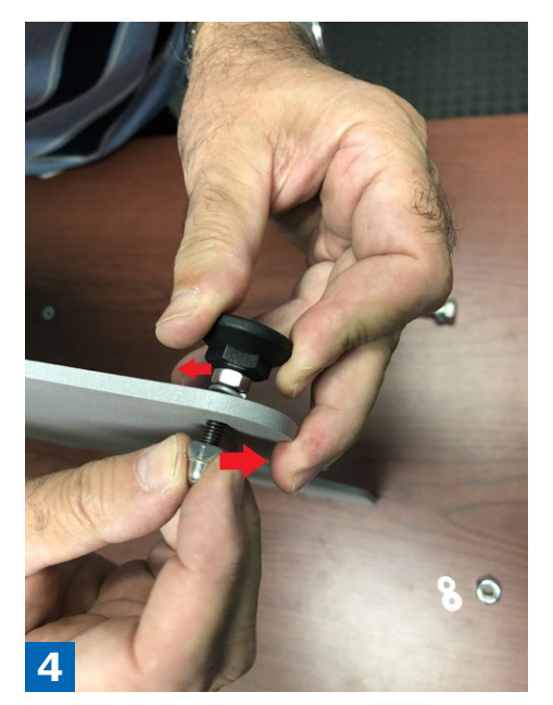
Secure the "acorn" nut turning clockwise while holding the stabilizing peg and rotating it counter clockwise.