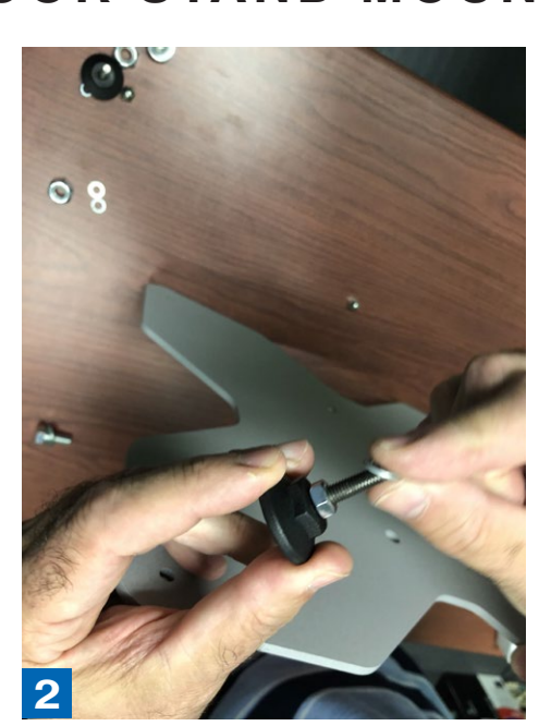
Install the crush washers and washer after nut. As shown in the image.