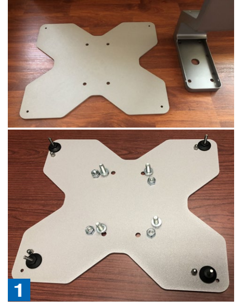
Layout the base plate next to the floor stand.